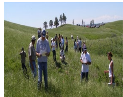
Ecological Site and Similarity Indexing Method Training, Pine Ridge SD

The increase promotes conservation, multiple use, and sustained yield management carried out by IA personnel or by Tribes under Indian self-determination agreements. Climate change exacerbates the spread of noxious weeds and the related impacts on soil and vegetation inventories. This program promotes healthy environments and native species that are resilient to the impacts from climate change. Activities center on these principal responsibilities: inventory, programmatic and conservation planning, farm and rangeland improvement, monitoring of vegetation, recruitment and placement of natural resource agriculture student interns, lease and permit administration, and rangeland protection. Services are provided to Tribal programs and individual Indian landowners and land users. The increase fosters Tribal community income, employment and economic development of Indian and Native Alaskan communities. Under the authority of the American Indian Agricultural Resource Management Act, P.L. 103-177, the program participates with the beneficial owners in the management of over 46 million acres of Indian land used for grazing and crop agriculture.