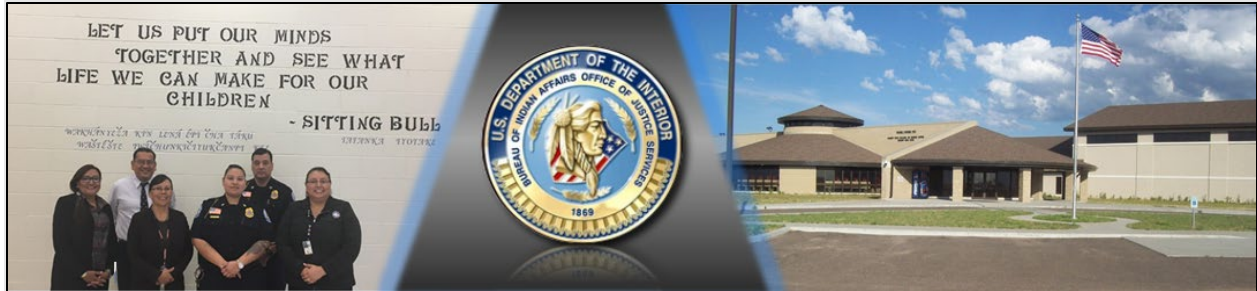
Officers and others standing together(left), IA Office of Justice Services seal (center), and grey OJS building with US flag in the foreground (right).

IA is responsible for providing Detention/Corrections services or funding to approximately 227 Tribes. Of those, 39 Tribes have compacted or contracted detention center services and BIA directly operates detention centers that serve roughly 21 Tribes. The detention needs of the remaining 167 Tribes are handled via “direct service”, whereby IA funds commercial contracts with local county or Tribal facilities to house Tribal inmates. The FY 2022 request includes an additional $8.0 million to support the operational needs of Indian Country detention and corrections programs. The additional resources will help cover growing personnel, equipment, and technology costs necessary to support safe and secure confinement of offenders.