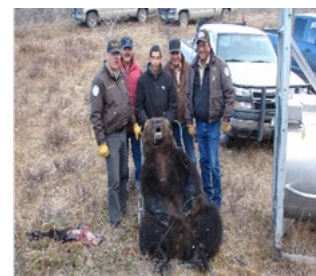
Blackfeet Tribal Game Wardens And Grizzly Management Staff in Montana

Tribal Fish & Game Projects - This program provides base funding for 26 Tribal fish and game management programs and enforcement of Tribal fish and wildlife codes through acquisition of conservation law enforcement officers. The development and enforcement of fish and game codes is the cornerstone of fish and wildlife management, and Tribal lands provide an important component of fish and wildlife habitats across the larger landscape. These funds allow Tribes to manage habitat and fish and wildlife resources while also collaborating with adjoining land managers to accomplish landscape-level management needs.