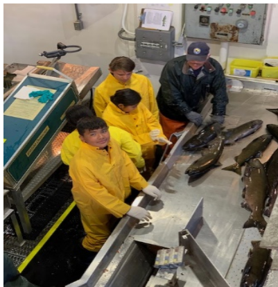
Yakama Tribal hatchery facilities, tribal youth assist in the work and contribute in many areas of research in streams and river projects on the reservations.

Columbia River Inter-Tribal Fish Commission (CRITFC) - CRITFC, formed in 1977, is recognized as a global leader in protecting and restoring treaty-based fisheries and implementing cost-effective management strategies. CRITFC is committed to the comprehensive management plan, Wy-Kan-Ush-Mi Wa-Kish-Wit “The Spirit of the Salmon” oriented to these long-term goals: restore anadromous fishes to the rivers and streams that support the historical, cultural, and economic practices of the Tribes; emphasize strategies that rely on natural production and healthy river systems to achieve this goal; protect Tribal sovereignty and treaty rights; and reclaim the anadromous fish resource and the environment on which it depends for future generations.