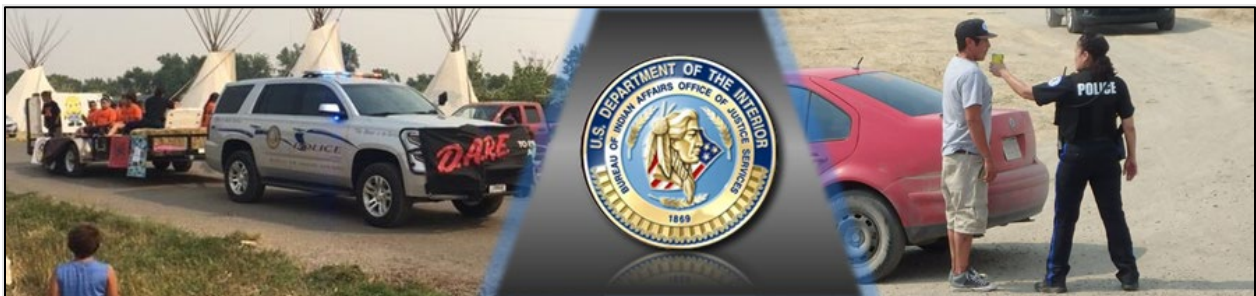
Police vehicle in a procession (left), IA Office of Justice Services seal (center), and an officer and civilian in a traffic stop (right).

The Office of Justice Services is responsible for enforcing laws and investigating crimes committed on or involving Indian Country, primarily where States lack local criminal jurisdiction. Programs address major Federal crimes as well as state crimes assimilated into Federal statutes, such as murder; manslaughter; child sexual abuse; kidnapping; rape; assault; arson; burglary; robbery; and the production, sale or distribution of illegal drugs. In addition to investigating crimes, OJS provides oversight and technical assistance to Tribal law enforcement agencies.