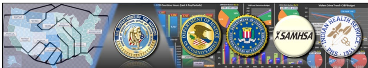
Design with US map in background and outline of clasped hands in a handshake pattern (left), IA Office of Justice Services seal (center), and seals of the US Attorneys Office, Federal Bureau of Investigation, Substance Abuse and Mental Health Services Administration, and Indian Health Service (right).

BIA is the Federal entity most directly responsible for maintaining law and order throughout Indian Country. This funding supports the Office of Justice Services’ national leadership team and a number of administrative or support services to manage the activity effectively for Tribes. The team collaborates with other Federal partners, and develops and disseminates standards, policies, and procedures for IA implementation of the law enforcement, corrections, emergency management, land mobile radio, Tribal court, and justice training programs.