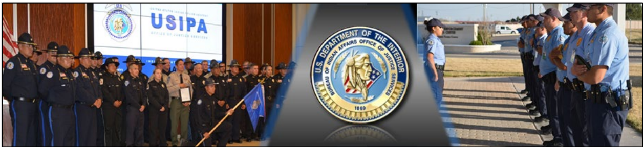
Officers standing together in a ceremony (left), IA Office of Justice Services seal (center), and officers standing at attention outside (right).

The Indian Police Academy (IPA) is located at the Department of Homeland Security Federal Law Enforcement Training Center at Artesia, New Mexico and provides basic police, criminal investigation, telecommunications, and detention training programs at no cost to Tribal or Federal personnel serving the critical public safety needs of Indian Country. The Academy offers a wide range of collaborative training opportunities at the FLETC- Artesia (NM) and Glynco (GA) Centers for instructor-led and e-FLETC courses and on-site training in specialized courses.