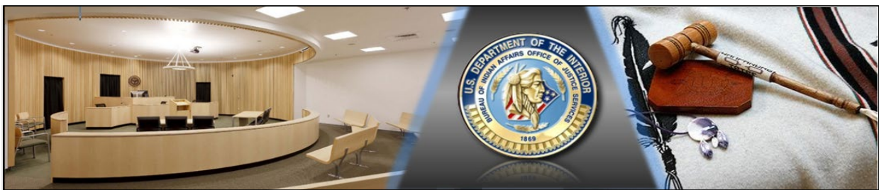
Tribal courtroom with wooden furniture (left), IA Office of Justice Services seal (center) and a wooden gavel set with Native design beside a decorative feather on a blanket (right).

The Office of Tribal Justice Support is a vital contributor to the BIA initiative to target significant and rising criminal justice issues impacting Native American communities, particularly Native women. The 2013 VAWA reauthorization included special domestic violence criminal jurisdiction provisions affecting Indian populations on reservations which has had a significant impact on Tribal justice systems. To ensure compliance with provisions contained in VAWA, IA conducts training for direct service program staff in the areas of law enforcement, social services, victim services, and courts, as well as provides additional technical assistance and training to Tribes operating these programs under Pub.L. 93-638 contracts and compacts, and assists Tribes in updating their codes to reflect provisions in the VAWA Reauthorization as they “opt in.”